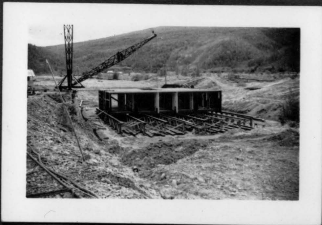
From the edge of the pit. The "hall", Camp in the background.