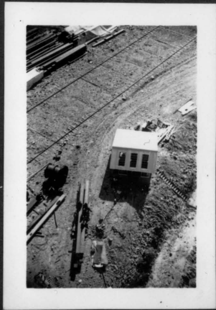
Derrick control house. & 20' gauge tracks for the 5 ton feeder derrick.